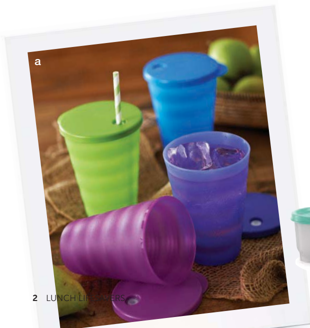
2 LUNCH LIFESAVERS