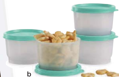
Colors may vary and substitutions may occur.